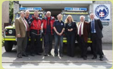
Penrith Mountain Rescue Team were successful in their application from the Community Fund to support their rescue work.